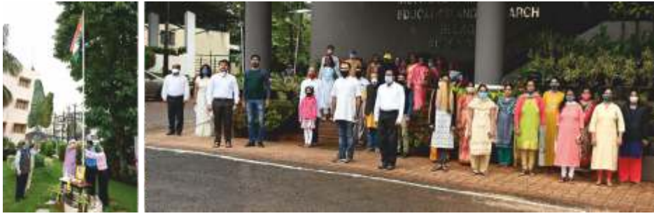
74th Independence Day 15th Aug, 2020