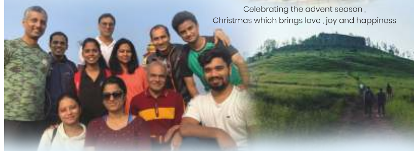
At TOASTMASTERS, we don't just talk but at trek!