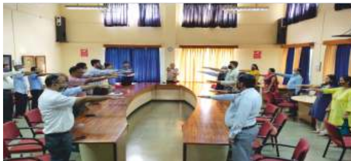
Voter Awareness Program Pledge Taking 25th Jan, 2021

Doctoral Degree awarded by University of Mysore in Management (Marketing) in June 2021