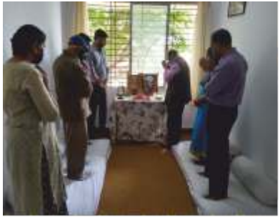
Gandhi Jayanti 2nd Oct, 2020