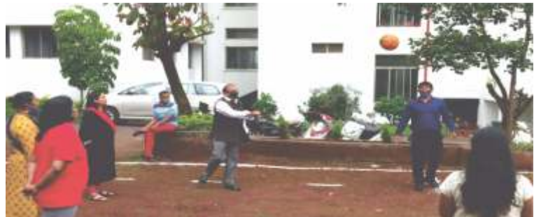
National Sports' Day 29th Aug, 2020