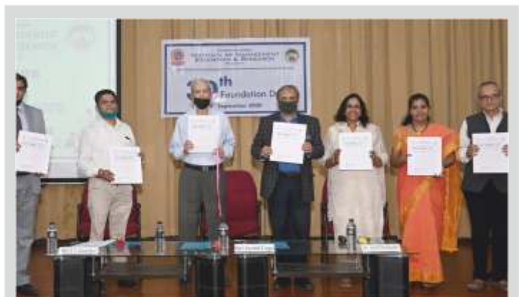
A newsletter of KLS IMER Advisory Cell 'CSR TIMES' was released by the dignitaries on the occasion.