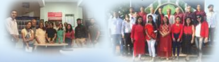
Celebrating the advent season, Christmas which brings love, joy and happiness