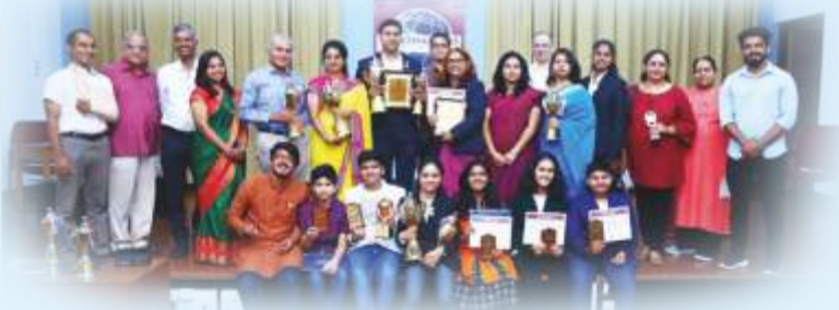
Annual Award Ceremony