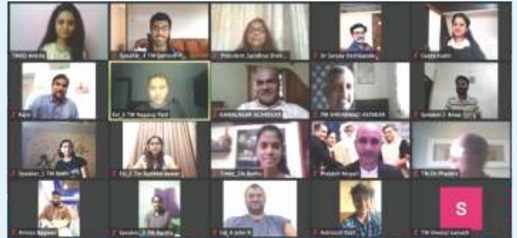
Making the best use of the online platform amidst the Pandemic. Adopting to the new normal

Toastmasters' really helped me overcome my stage fear, vocabulary and public speaking. 'A must platform' for everyone.