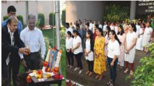
Republic Day 26th Jan, 2021